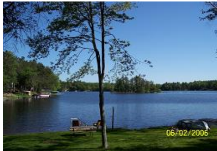
View from living room window.

The cottage is clean, attractively furnished, and ready for your carefree stay on the lake. It has two bedrooms, living area, dining area, and a bathroom with tub and shower. It is fully furnished with a modern kitchen. Included in the furnishings are cable T.V., DVD Player, AM/FM radio, alarm clocks, microwave oven, electric coffee-maker, gas range, and refrigerator. Also included are pots and pans, dishes, and bed linens. The cottage has vaulted ceiling in the living room and ceiling fans in the living room and both bedrooms. Outside the cottage is a Weber grill, picnic table, lawn furniture, and a fire ring. There is a pier off the shore where you can sit back and enjoy a relaxing view of beautiful Lake Nokomis. Great accommodations at affordable rates.